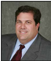
Jonathon Wolfson Mayor Pro Tem