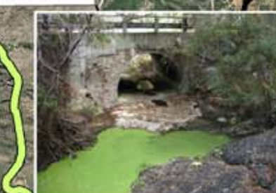
4. Piuma Culvert