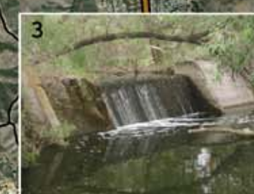
3. White Oak Dam