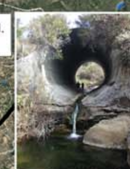
7. Cold Cyn. Rd. Culvert