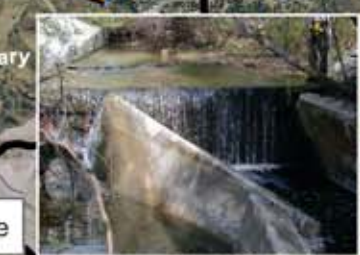
9. Meadow Creek Lane