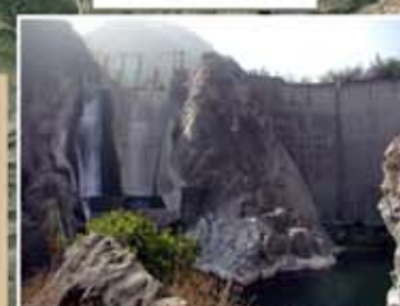
1. Rindge Dam