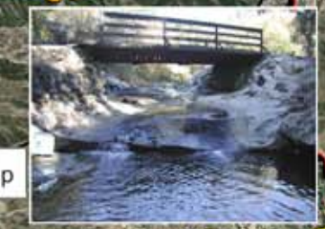
6. Crater Camp