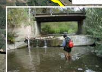
5. Malibu Meadows Rd.