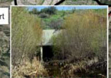
8. Lost Hills Rd. Culvert