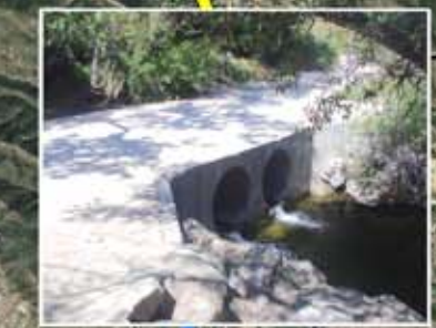
2. Crags Culvert